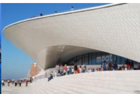
Art Architecture and Technology Museum