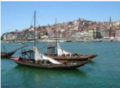
e Porto view from Douro River

The rest of the afternoon will be free to visit the beautiful and charming Foz do Douro area