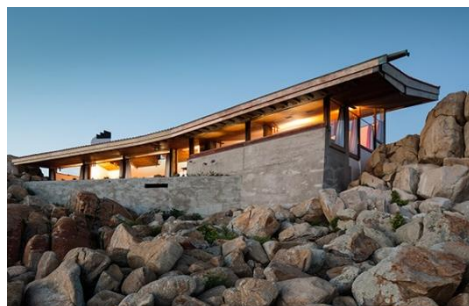
Casa de Chá da Boa Nova – Arch Siza Vieira