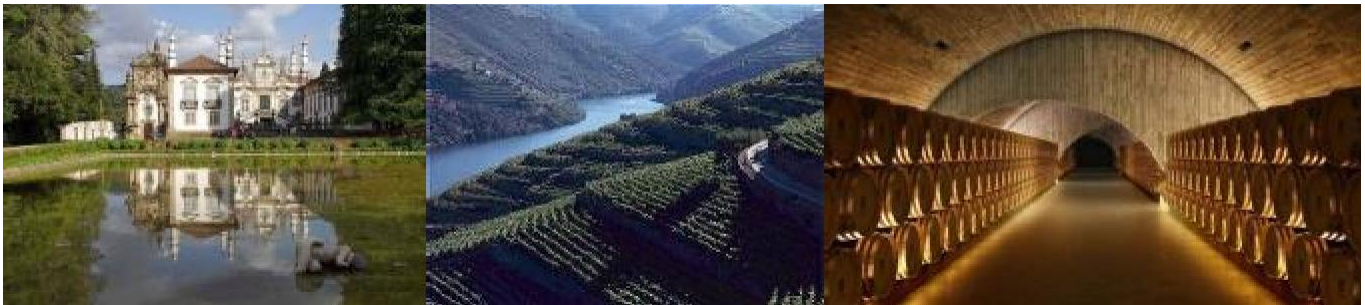
Vila Real – Palácio de Mateus