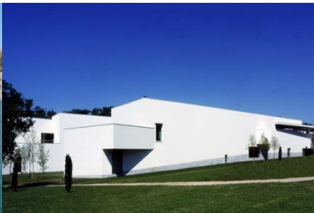
Serralves Contemporary Art Museum