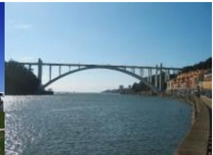
Porto – Arrábida Bridge

08:30 pm – Dinner at Cafeína , one of the best restaurants in Porto.