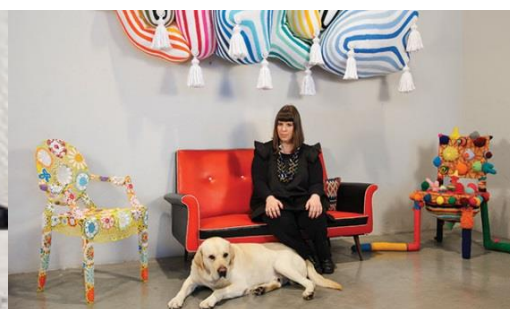
Joana Vasconcelos's Studio