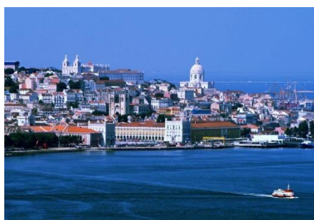
Lisbon view from Tejo River