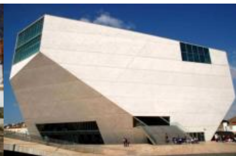
Casa da Música – Arch Rem Koolhaas