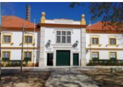
Vista Alegre Museum