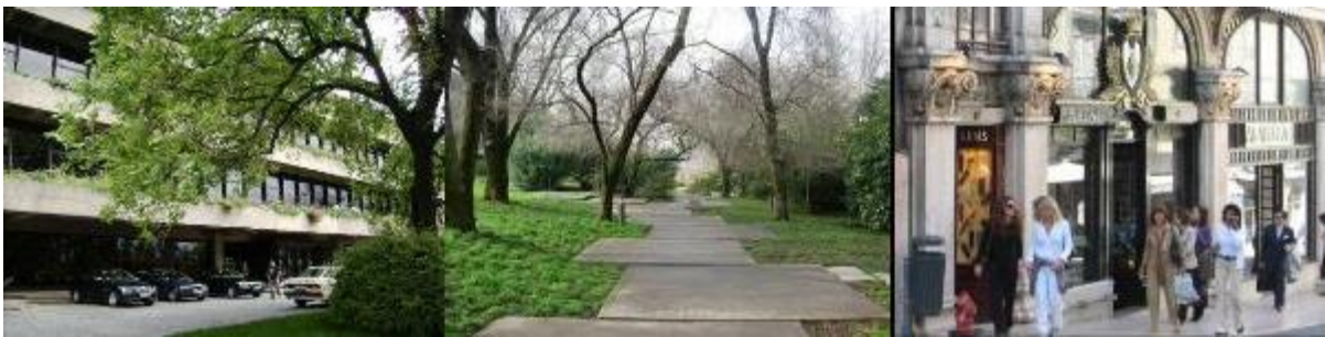
Lisbon- Calouste Gulbenkian Museum and Foundation

Calouste Gulbenkian was an Armenian businessman (petroleum) and philanthropist. He died in 1955 in Lisbon and willed a percentage of his fortune to the Calouste Gulbenkian Foundation whose mission includes art, education, charity and science. On the premises you will find the foundation offices, Calouste Gulbenkian Museum and the Art Library , gardens, a large auditorium and the Modern Art Centre . https://gulbenkian.pt/