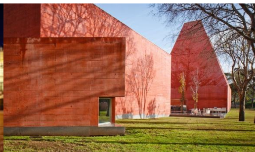
Casa das Histórias Paula Rego Museum

FREE AFTERNOON to visit the charming old town of Cascais.