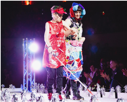
Photo Credit: Courtesy of Creative Growth, Monica Valentine, and featherweight.